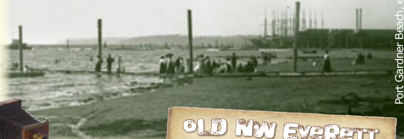
Port Gardner Beach, early 1900s.