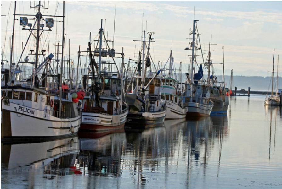
Boats at the Port of Everett